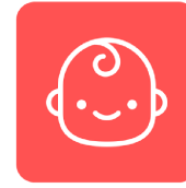
NHP Indrdhanush App (page 152)