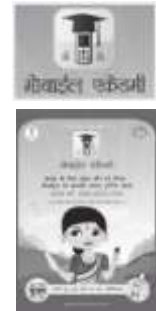
Refer Color Plates Pg. No: 166