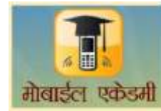
Mobile Academy (page 154)