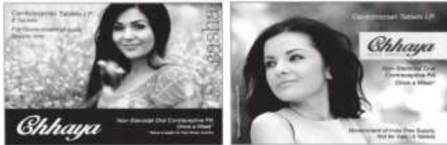
Refer Color Plates Pg. No: 164

Centchroman (Chhaya) is available in two packages: ASHA supply and free supply. Each pack contains 8 tablets. ASHA supply is for home distribution and free supply is for distribution at health facilities.