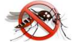
India Fights Dengue App (page 152)